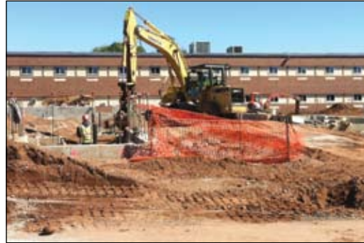
DePaolo Middle School, Southington CT