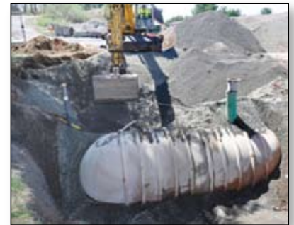
Removal of old underground tanks

The project consisted of removing three underground storage tanks with the installation of new above ground storage tanks known as ConVaults as manufactured by United Concrete. Kessler Installation and Kessler Construction were involved with all the mechanical phases on the project. A & S Electrical was in charge with all of the electrical installation work. The project was substantially completed on August 27, 2013.