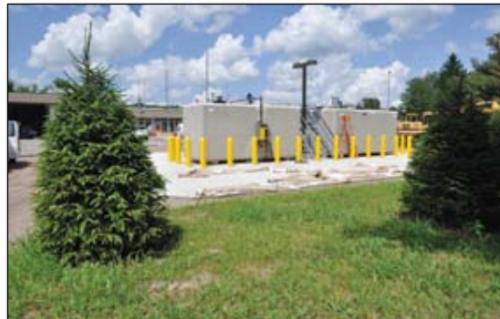
Final above ground storage tanks

We were also awarded another tank replacement job for the DOT in Canterbury, CT which is identical to Vernon. It will be managed by the same team.