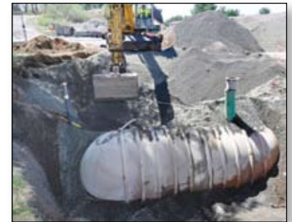
Removal of old underground tanks

The project consisted of removing three underground storage tanks with the installation of new above ground storage tanks known as ConVaults as manufactured by United Concrete. Kessler Installation and Kessler Construction were involved with all the mechanical phases on the project. A & S Electrical was in charge with all of the electrical installation work. The project was substantially completed on August 27, 2013.