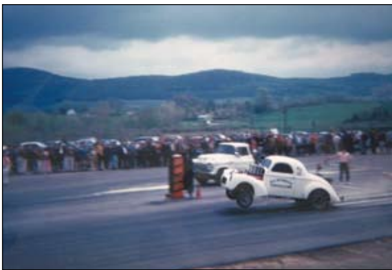
June 1966: Dover Drag Strip, Wingdale, NY